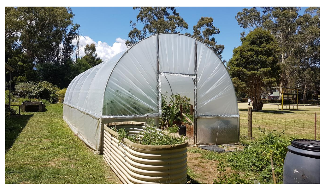
Site upgrades include refurbishing the polyhouse.